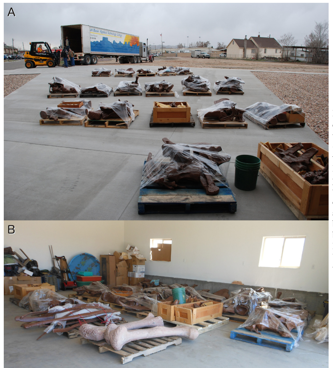
Figure 11. The elements of the concrete cast moving from Vernal to Price, Utah, on April 8, 2013. (A) The concrete cast packed onto wooden pallets outside the new Field House building, having been prepared for transportation to the Utah State University Eastern campus in Price, about 100 miles southwest of Vernal. (B) The same bones having been unpacked into Ken Carpenter's garage in Price, Utah.

The Concrete Diplodocus of Vernal—A Cultural Icon of Utah Taylor, M.P., Sroka, S.D., and Carpenter, K.