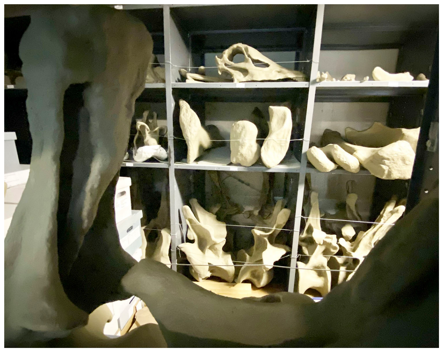
Figure 13. The elements of the concrete cast as they are now, having been cleaned and stored in the basement storage area on the Utah State University Eastern campus in Price, Utah.

Even the Diplodocus that started it all, the cast presented by Andrew Carnegie to the British Museum (Natural History) on May 12, 1905, seems to be ambling towards an undistinguished fate. Having been the centerpiece of the museum's main hall for nearly four decades, it was removed in 2017 to make more space for corporate events (Steerpike, 2015; Nieuwland, 2019, p. 260). The cast was sent on a tour of the UK, but now that this has concluded, "in all likelihood the plaster dinosaur will meet an inglorious end in the basement of the museum" (Nieuwland, 2019, p. 4). However, while