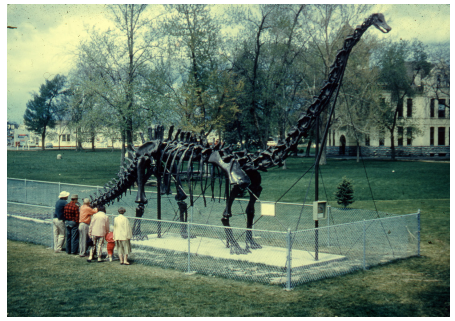
Figure 5. The completed outdoor Diplodocus mount in a rare color photograph (undated).

ed that casting "will start soon" (Anonymous, 1960d), but evidently that work was significantly delayed as nearly a year later on June 11, 1961, the museum reported that "work will begin here Monday on a replica of a pre-historic dinosaur that will eventually tower 21 feet in Sunset Park [...] the project will consume many months before the animal will be erected on a frame in the park" (Anonymous, 1961a). Already by this point the disorganization and physical state of molds was of concern as "Several months will be involved classifying and preparing molds for casting" (Anonymous, 1961a).