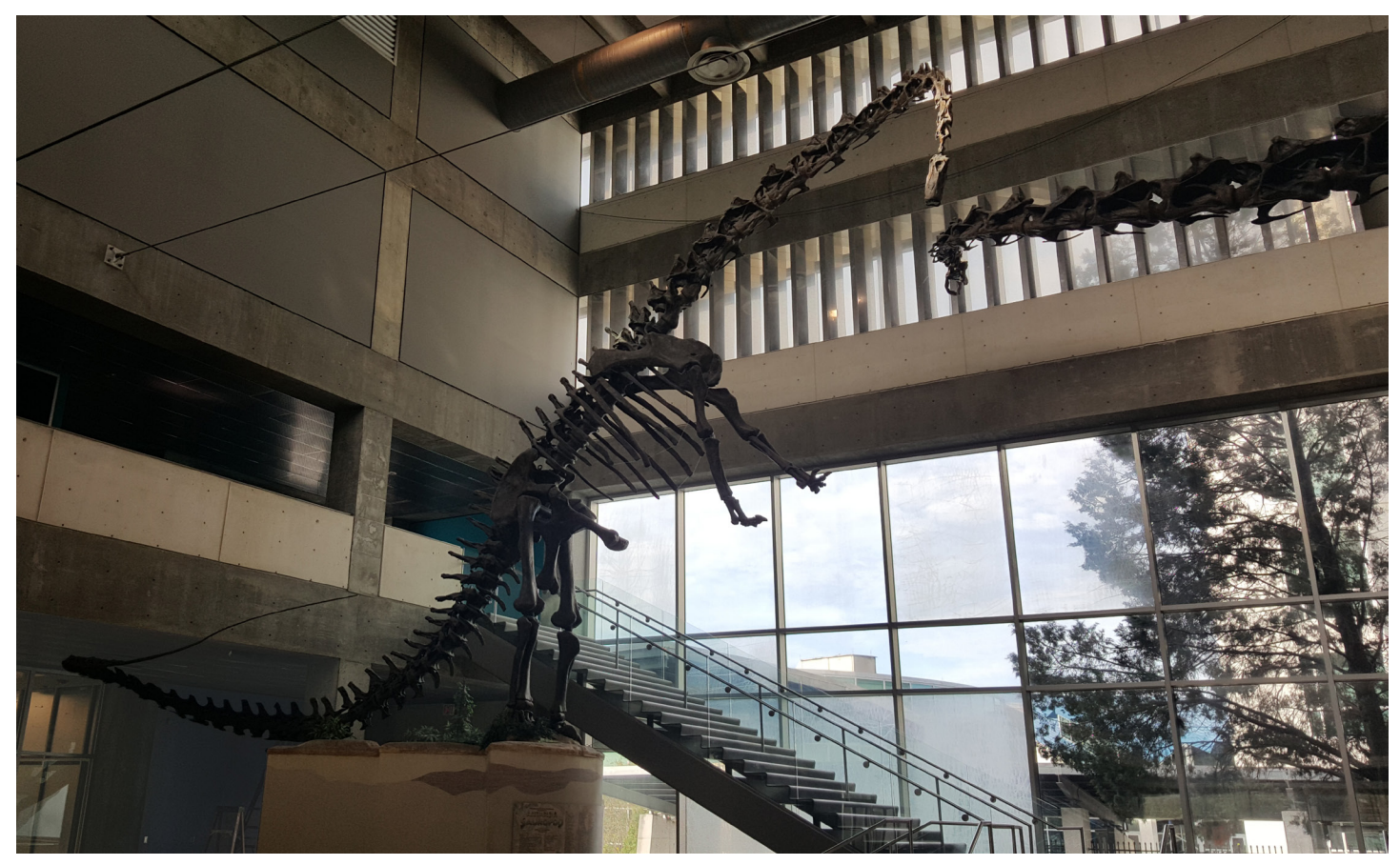
Figure 10. Double Diplodocus mount at the Museum of Science and Industry (MOSI), Tampa, Florida. Both individuals are identical, having been cast from the molds made by Dinolab from the concrete Diplodocus of Vernal. Photograph by Anthony Pelaez, taken between 1997 and 2017.

gested posting a news article requesting the return of the bones, and the workman came forward with them enabling the femora to be reunited with the rest of the concrete skeleton.