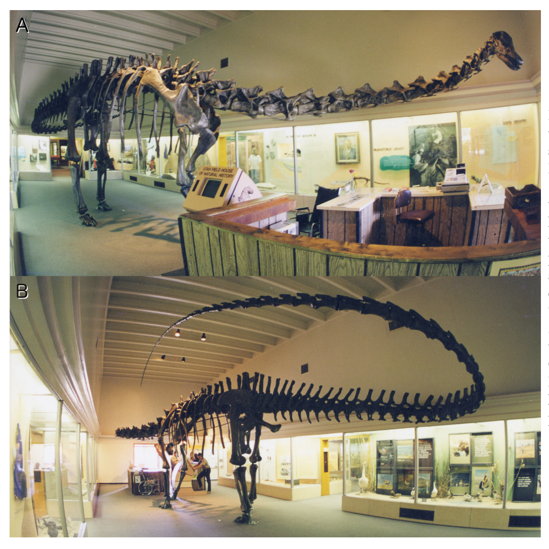
Figure 8. The second-generation lightweight Diplodocus cast as originally displayed at the old Field House building between 1994 and 2004. (A) Right anterolateral view, showing the head and neck projecting above the admission counter. (B) Left posterolateral view, emphasizing the curvature of the elevated tail necessary to fit the 76-foot-long skeleton into the 50-foot-long exhibit hall. Photographs taken in May 1999 by Chet Gottfried, using a Pentax LX camera with a 17 mm rectilinear fisheye lens. Used by kind permission.

In subsequent years, further casts were made from the Dinolab molds. Table 1 summarizes information from Madsen's (1993) report to the Carnegie Museum and the Field House, together with additional in-