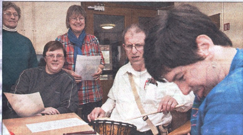
•Great fun...members apply themselves to newly-learned instrumental skills