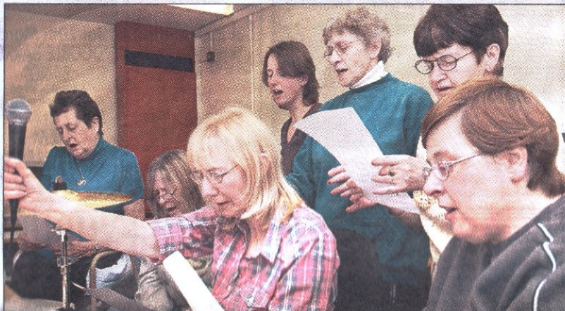
•The group get in tune for their recording with help from Drybrook choral singers.

A GROUP of adult service-users at Foxes Bridge Centre have enjoyed music lessons with Drybrook and District Ladies' Choir and are getting out and about in the community to entertain.